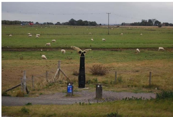
Waymark at the point at which the cycle route crosses the Rye to Camber Road

Refreshments, Numerous in Rye and Camber. Access not yet checked but see details for the ramble below.