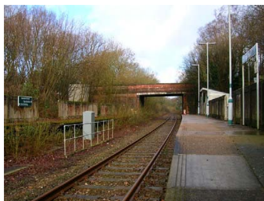
Three Oaks Station- Only 3 trains a day!